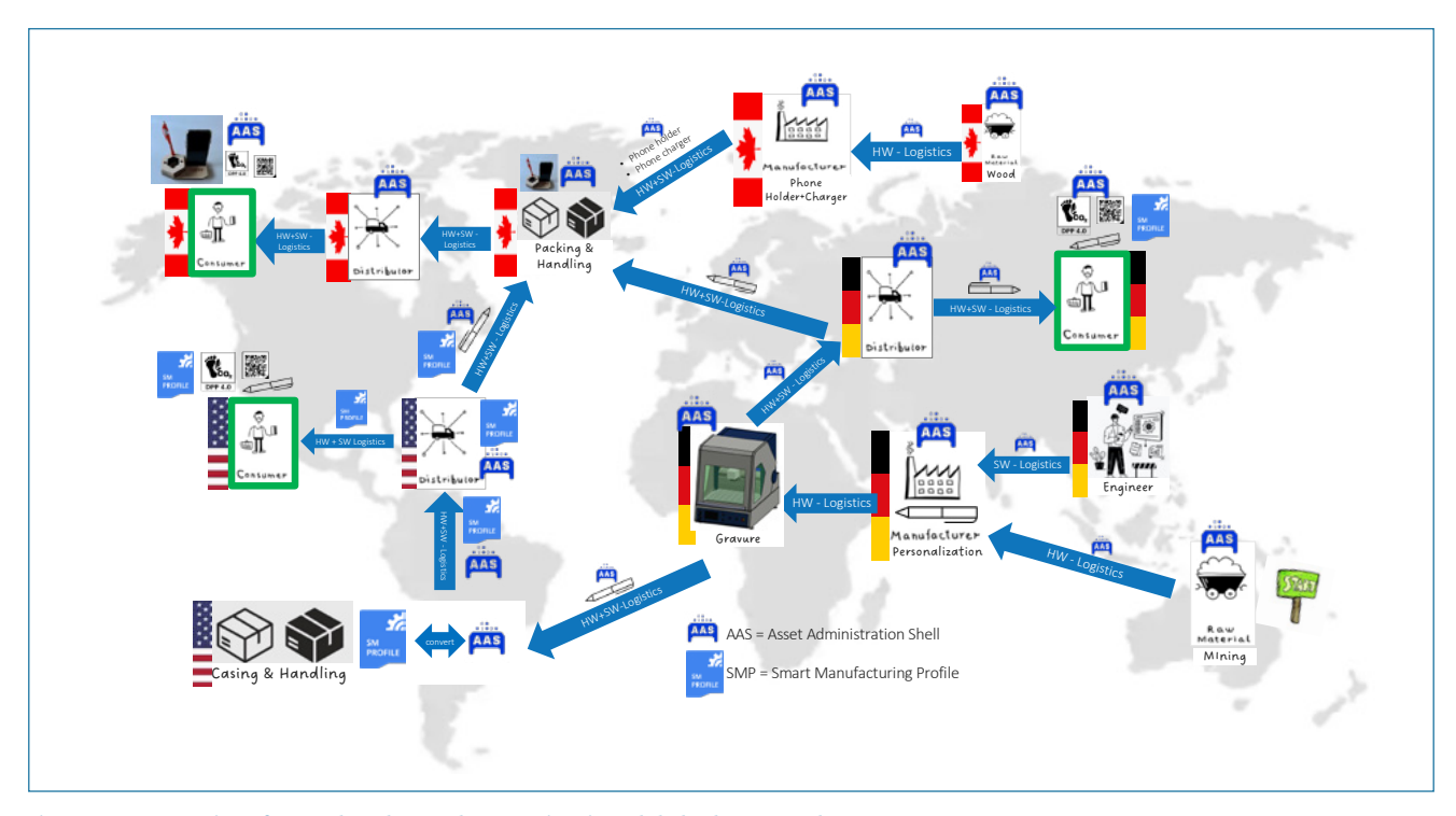
Figure: Demonstration of exemplary data exchange points in a global value network